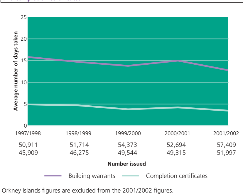
Figure 3: Average time taken to process requests for building warrants and completion certificates