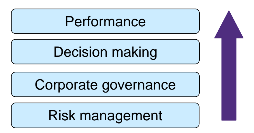
Exhibit 4 – Why is risk management important