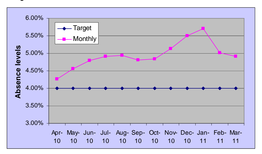
Diagram 4 - Sickness Absence Levels within NHS Fife

the Board's absence level has risen from 4.3% to 5.7% as at January 2011 before falling to 4.9% in March 2011 (Diagram 4).