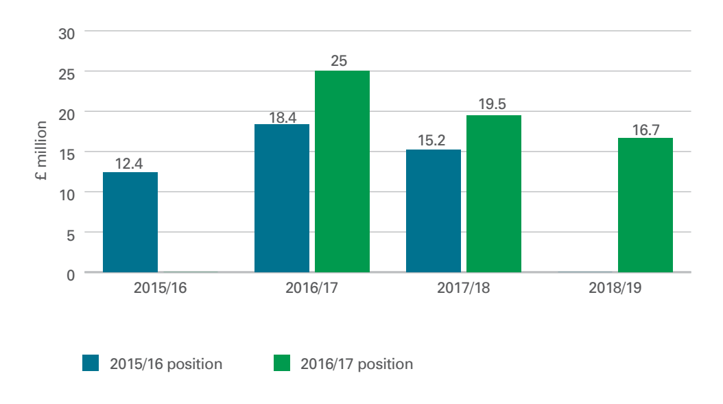
Exhibit 1 Three-year budget gaps identified in 2015/16 and 2016/17