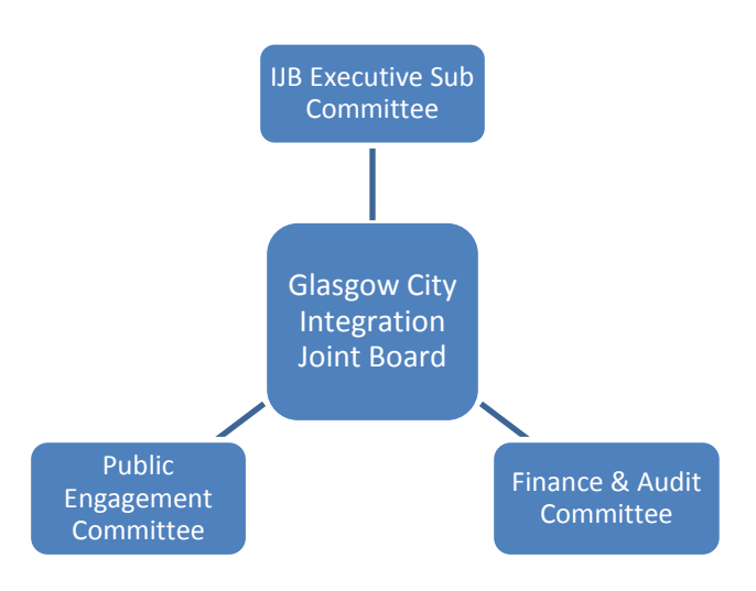
Exhibit 1: Committees at Glasgow City Integration Joint Board