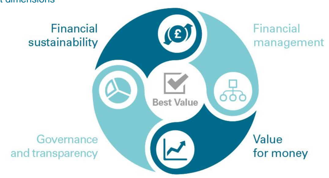
Exhibit 5 Audit dimensions

22. In the local government sector, the appointed auditor's annual conclusions on these four dimensions will contribute to an overall assessment and assurance on best value.