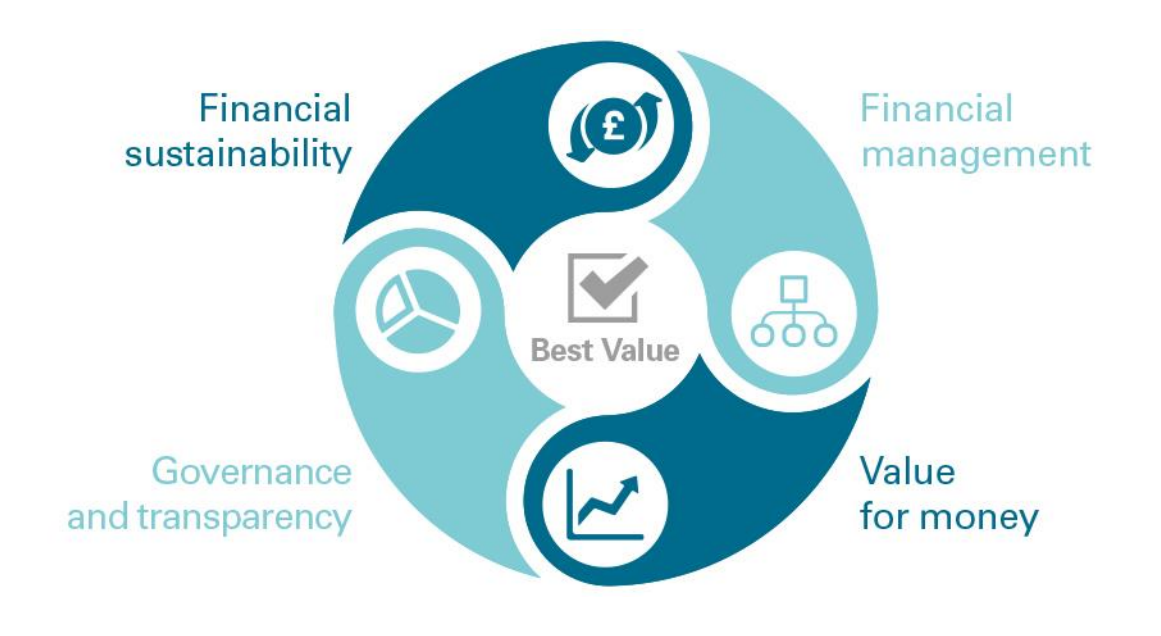
Exhibit 5 Audit dimensions

21. Our audit is based on four audit dimensions that frame the wider scope of public sector audit requirements as shown in Exhibit 5.