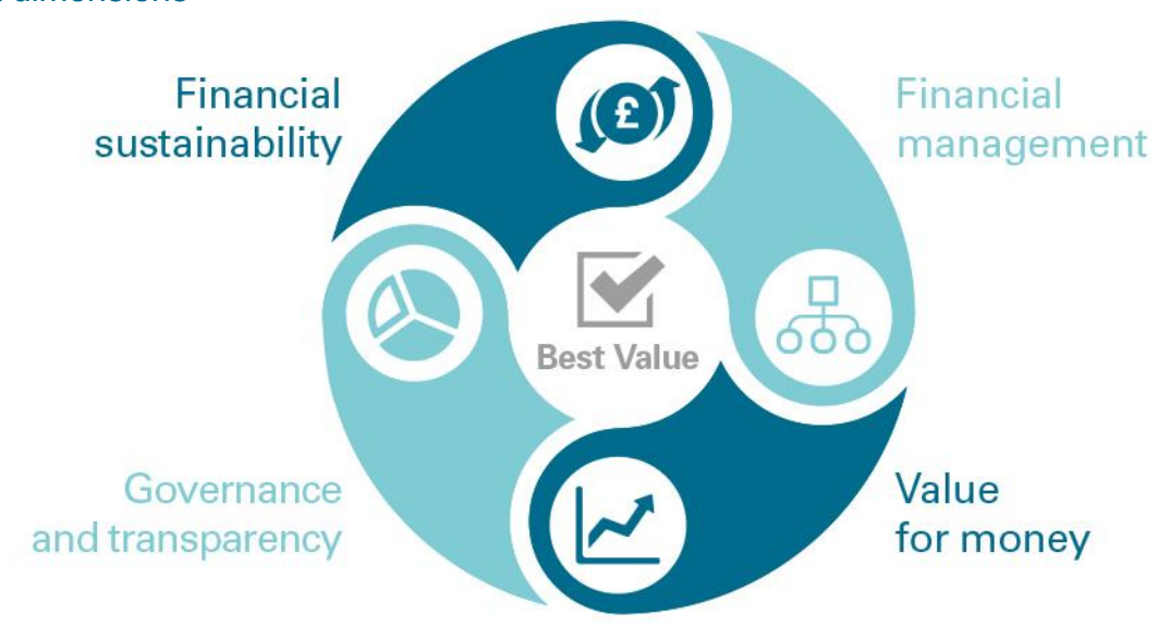
Exhibit 5 Audit dimensions

20. Our audit is based on four audit dimensions that frame the wider scope of public sector audit requirements as shown in Exhibit 5.