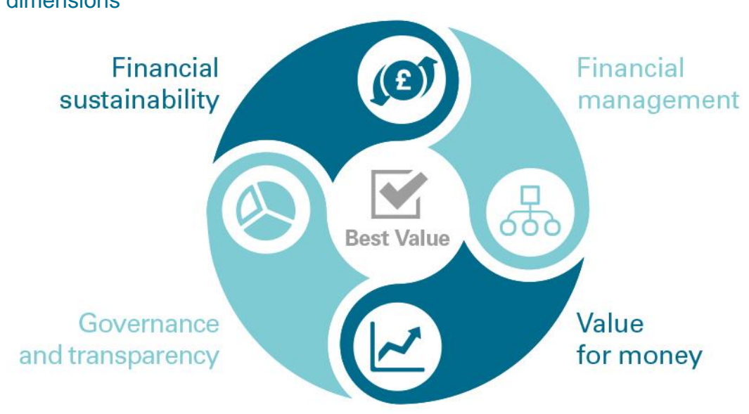
Exhibit 5 Audit dimensions