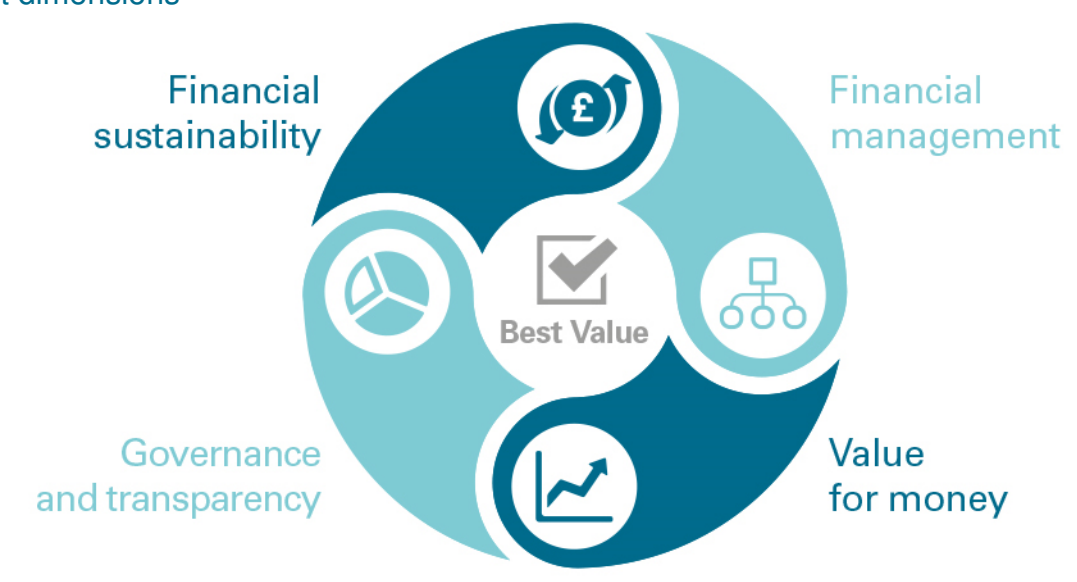
Exhibit 5 Audit dimensions

20. In the local government sector, the appointed auditor's annual conclusions on these four dimensions will contribute to an overall assessment and assurance on best value.