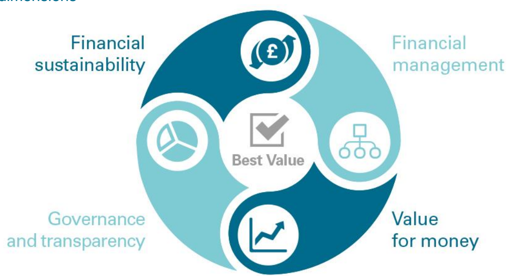
Exhibit 5 Audit dimensions

20. As noted at paragraph 1 above, we are required to meet the wider scope requirements of public sector audit which are outlined in the Code of Audit Practice. Our audit is based on four audit dimensions that frame the wider scope of public sector audit requirements as shown in <a href="Exhibit 5">Exhibit 5</a>. As part of our responsibility to report on the four audit dimensions, we have identified specific areas of audit work for 2016/17 and these are outlined in Exhibit 1 above. We plan to undertake further work on these dimensions over our five year audit appointment.