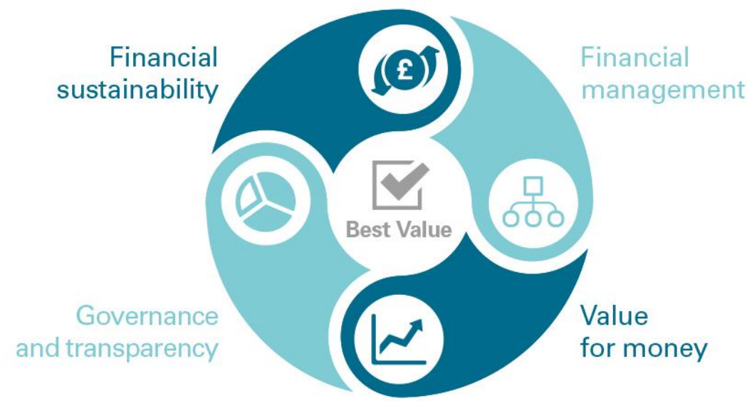
Exhibit 5 Audit dimensions

25. Our audit is based on four audit dimensions that frame the wider scope of public sector audit requirements as shown in Exhibit 5.