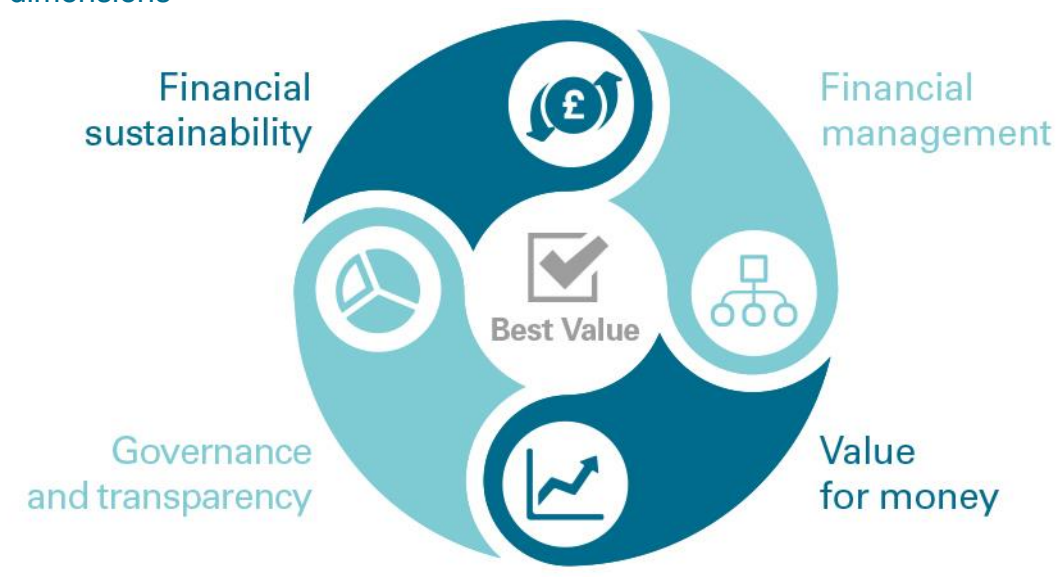
Exhibit 5 Audit dimensions

24. Our audit is based on four audit dimensions that frame the wider scope of public sector audit requirements as shown in <a href="Exhibit 5"><u>Exhibit 5</u></a>.