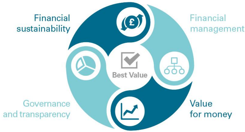
Exhibit 5 Audit dimensions

22. Our audit is based on four audit dimensions that frame the wider scope of public sector audit requirements as shown in Exhibit 5.