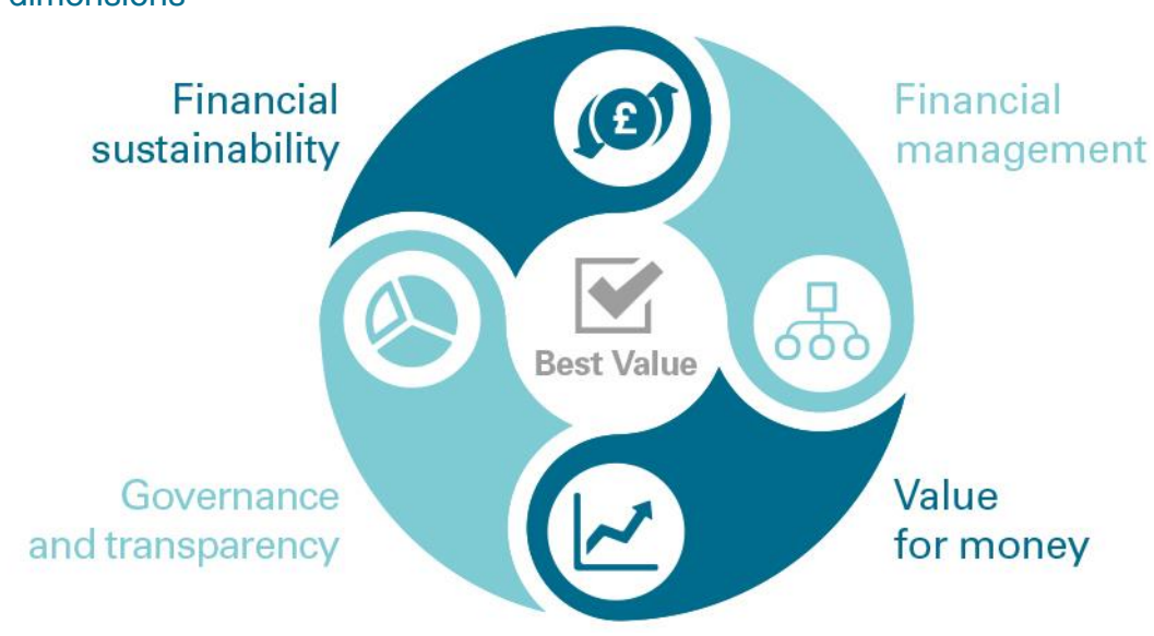
Exhibit 5 Audit dimensions

22. Our audit is based on four audit dimensions that frame the wider scope of public sector audit requirements as shown in Exhibit 5.