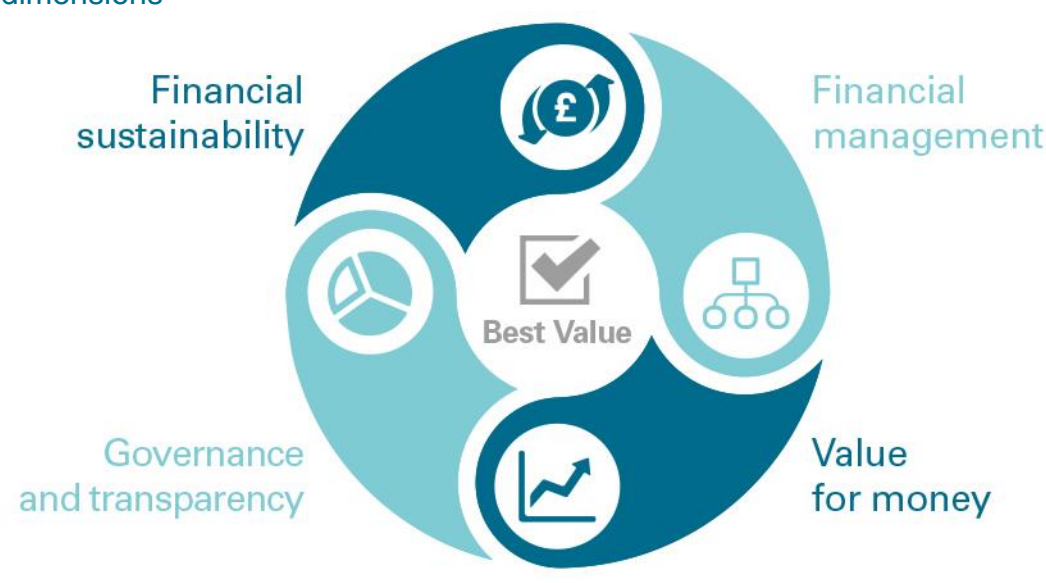
Exhibit 5 Audit dimensions

22. Our audit is based on four audit dimensions that frame the wider scope of public sector audit requirements as shown in Exhibit 5.