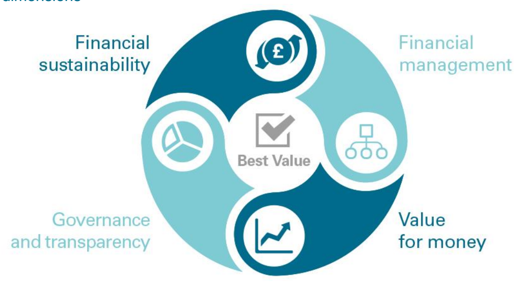
Exhibit 6 Audit dimensions

26. Our audit is based on four audit dimensions that frame the wider scope of public sector audit requirements as shown in Exhibit 6.