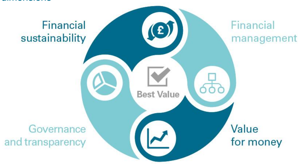
Exhibit 5 Audit dimensions

23. Our audit is based on four audit dimensions that frame the wider scope of public sector audit requirements as shown in Exhibit 5.