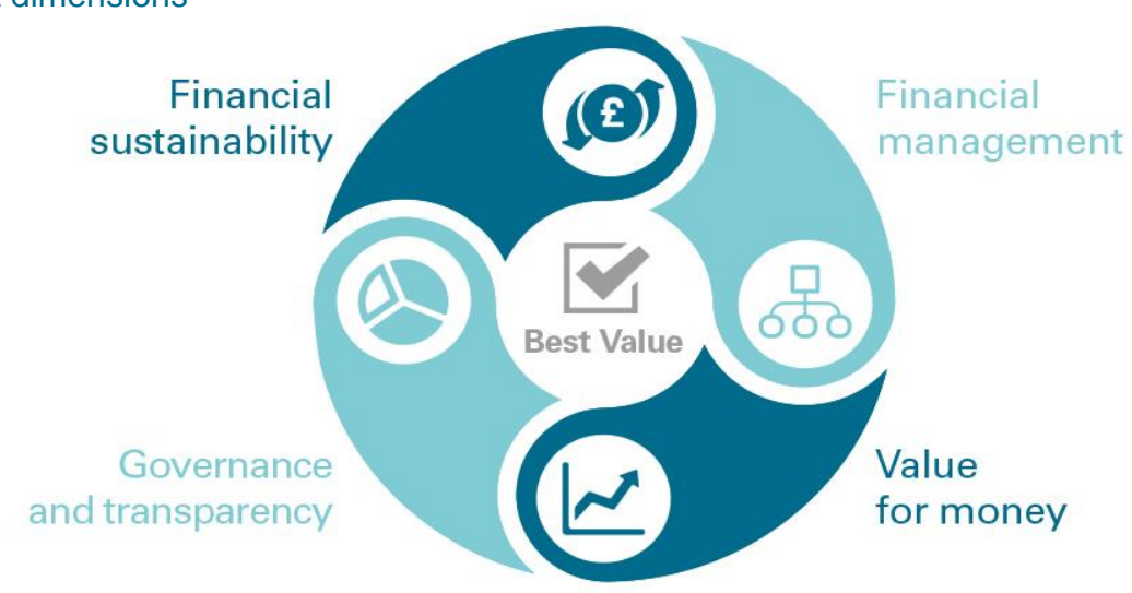
Exhibit 5 Audit dimensions