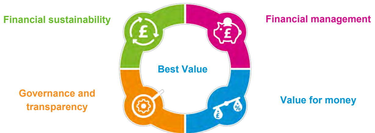
Exhibit 1: Audit Dimensions within the Code of Audit Practice