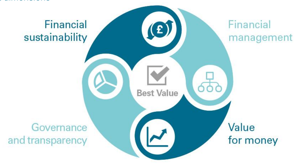
Exhibit 1 Audit dimensions