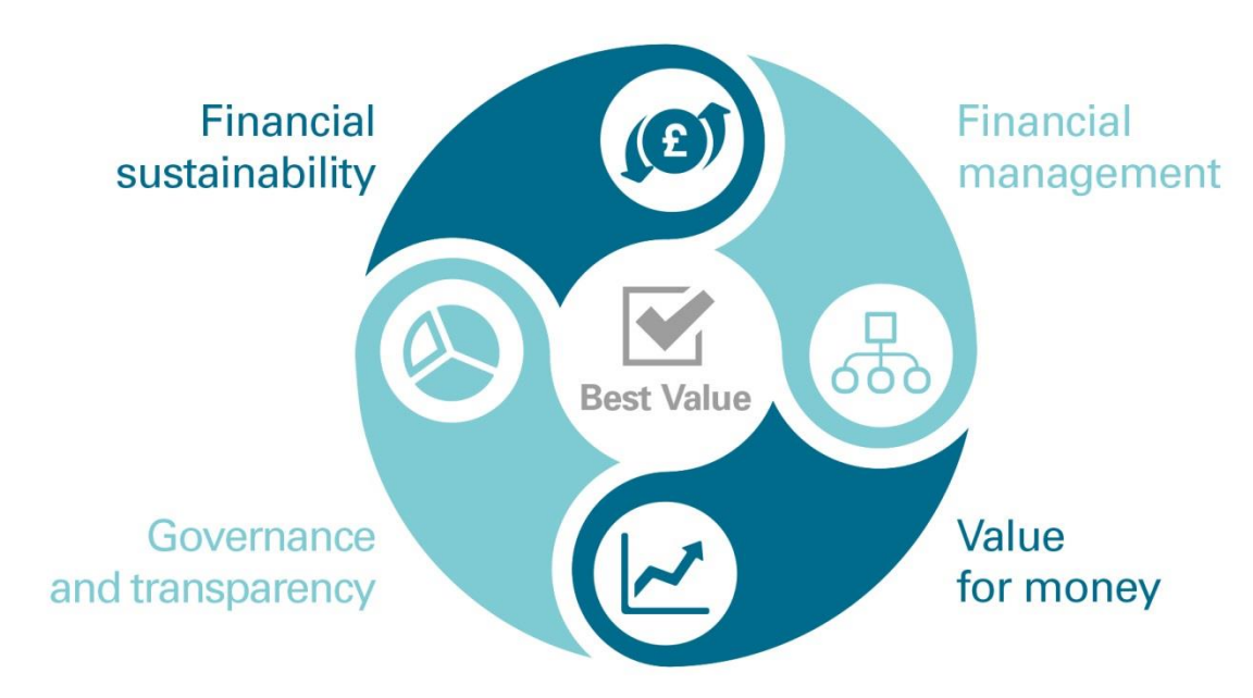
Exhibit 1 Audit dimensions