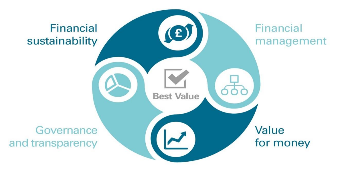
Exhibit 1 Audit dimensions