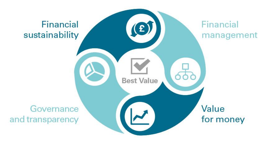
Exhibit 5 Audit dimensions

25. Our audit is based on four audit dimensions that frame the wider scope of public sector audit requirements as shown in Exhibit 5.