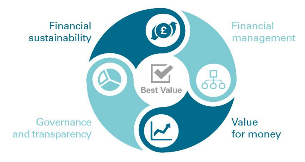
Exhibit 5 Audit dimensions

25. Our audit is based on four audit dimensions that frame the wider scope of public sector audit requirements as shown in Exhibit 5.