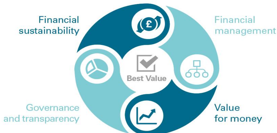
Exhibit 1 Audit dimensions

4. Our standard audits are based on four audit dimensions that frame the wider scope of public sector audit requirements. These are: financial sustainability, financial management, governance and accountability and value for money, as shown in Exhibit 1 . Due to the nature of the NDR Account, we have assessed the extent of wider dimensions work and concluded that a reduced scope, as outlined in the Code of Audit Practice, can be applied. This will focus on financial sustainability, financial management and governance and transparency. Value for money is concerned with using resources effectively and continually improving services. As non-domestic rates are used as part of individual local authorities' funding, the value for money dimension is not considered as part of this audit.