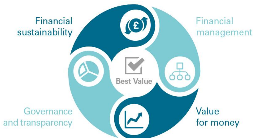
Exhibit 1 Audit dimensions