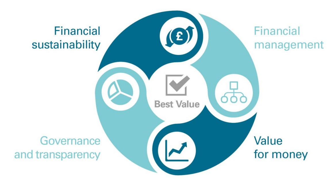
Exhibit 1 Audit dimensions