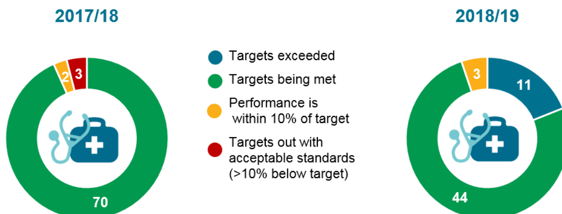
Exhibit 9 Overall performance against ODP targets