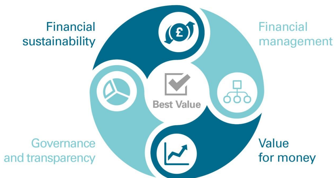
Exhibit 1 Audit dimensions