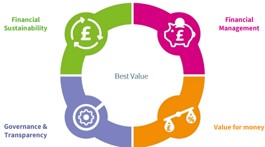
Exhibit 1: Audit dimensions within the Code of Audit Practice