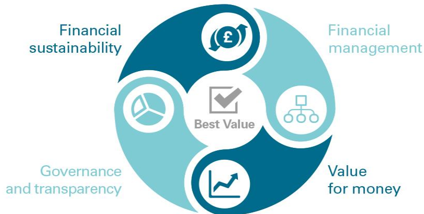
Exhibit 5 Audit dimensions