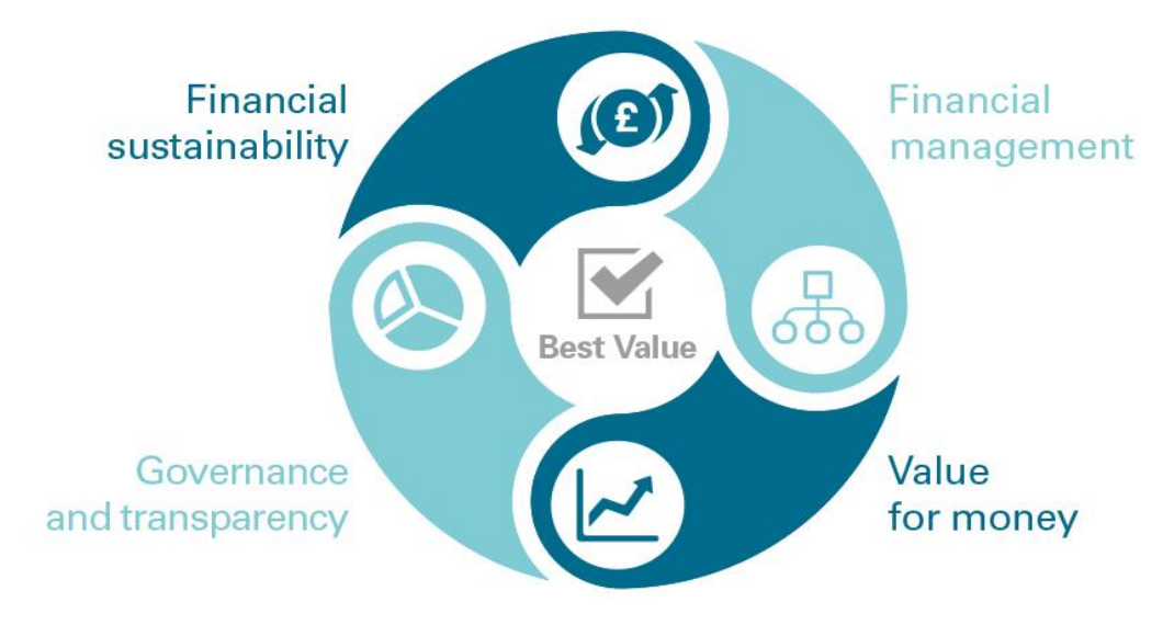
Exhibit 5 Audit dimensions

24. Our audit is based on four audit dimensions that frame the wider scope of public sector audit requirements as shown in Exhibit 5.