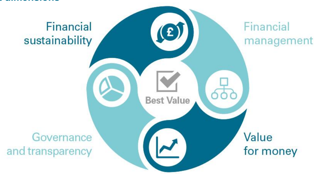
Exhibit 1 Audit dimensions