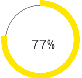
Exhibit 1: Planned transformational savings within social care were not delivered in full