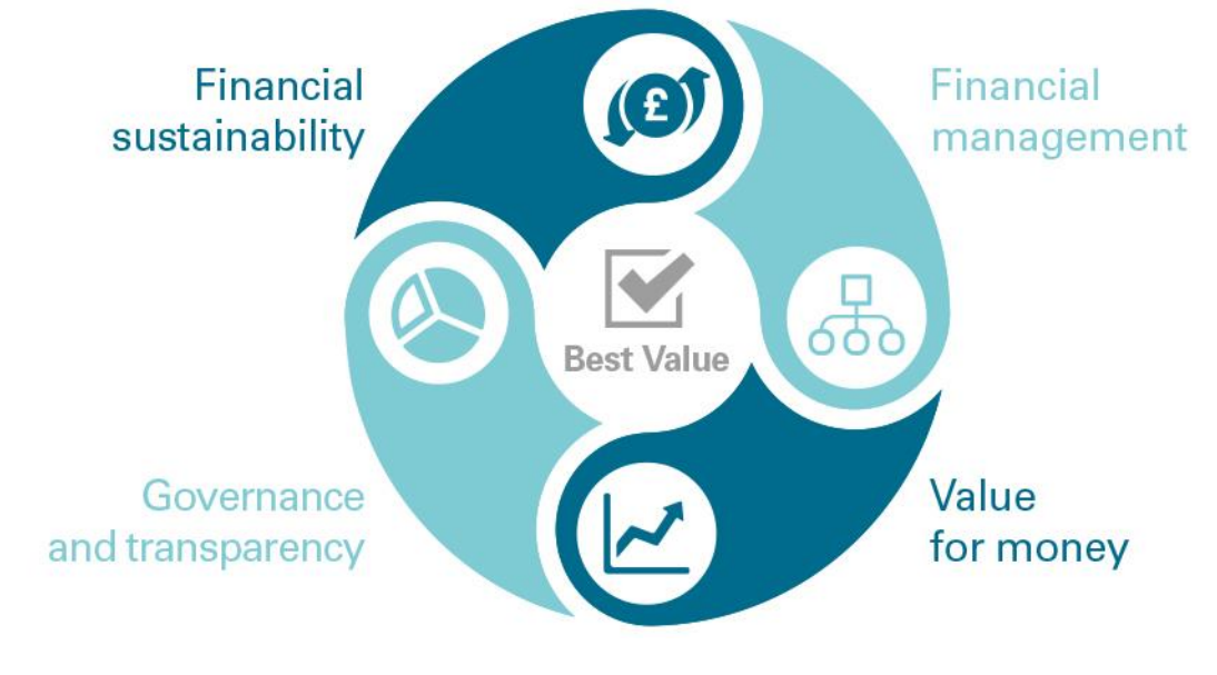
Exhibit 1 Audit dimensions