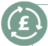
Exhibit 4 - Our audit approach to the wider scope audit dimensions