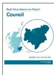
Exhibit 5 2022 Best Value Assurance Reports

31. BVARs will be considered by the Accounts Commission between February and September 2022 on the councils listed in Exhibit 5 .