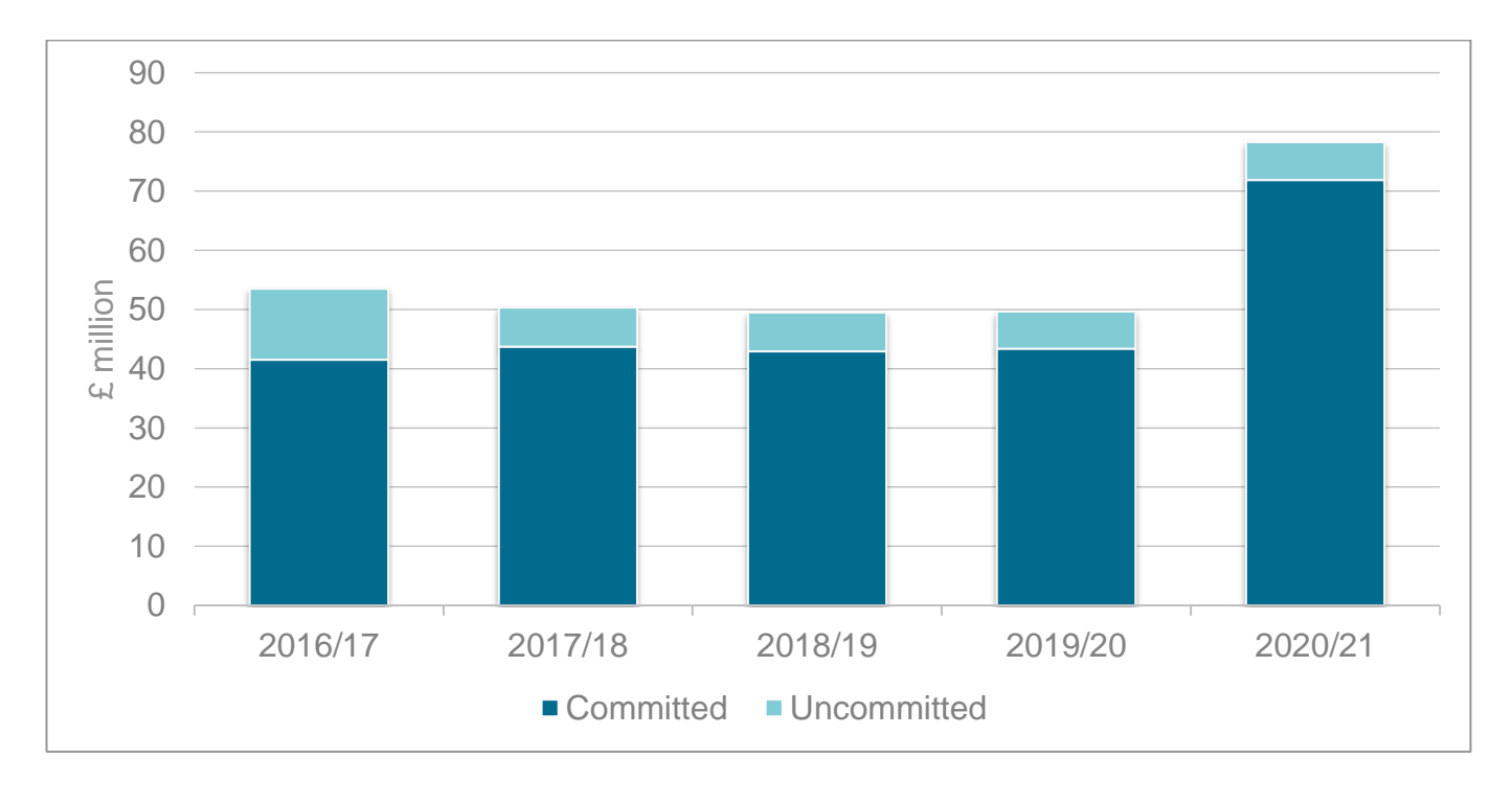
Exhibit 4 Analysis of general fund balance