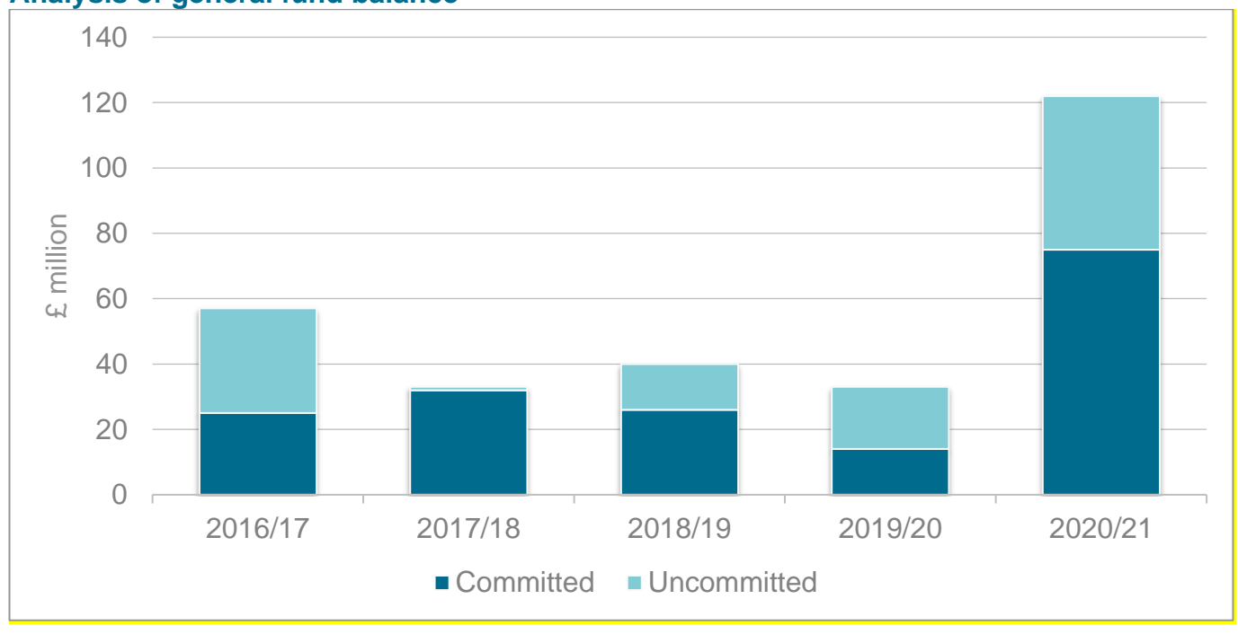
Exhibit 7 Analysis of general fund balance