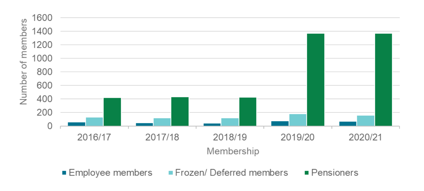
Exhibit 6 Transport Fund membership