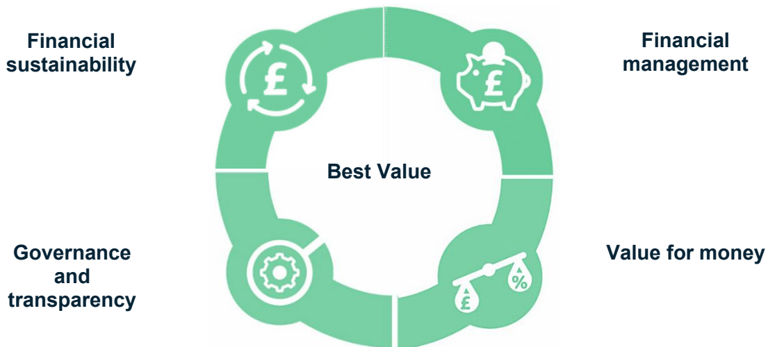
Exhibit 1: Audit dimensions within the Code of Audit Practice