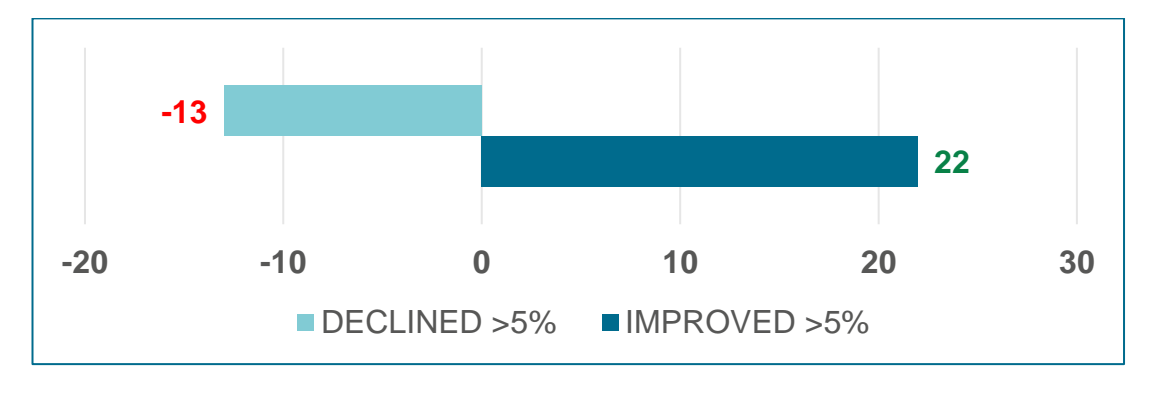
Exhibit 4 Comparison of 55 LGBF indicators from 2018/19 to 2021/22 22 indicators have improved by more than 5 per cent