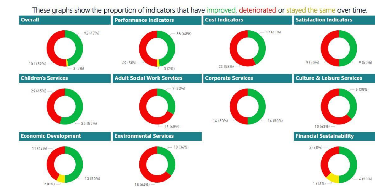
Exhibit 6 Dumfries and Galloway Council LGBF results – trend since base year