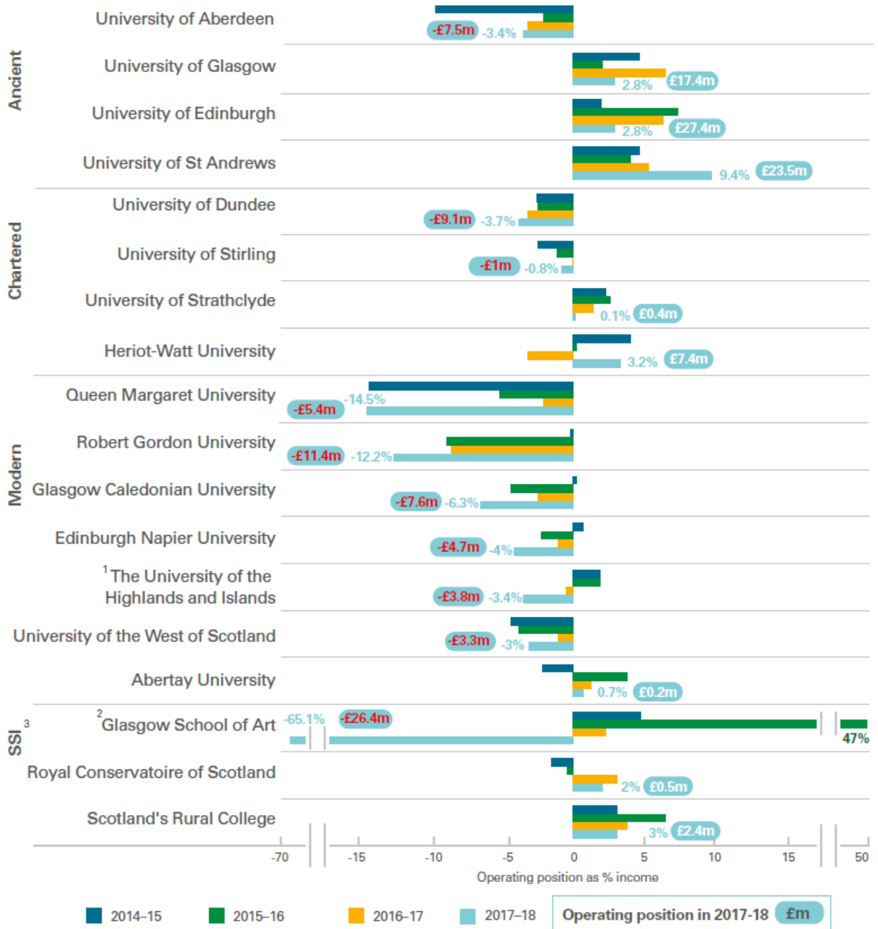
Exhibit 2 - Operating position as a percentage of income by university, 2014-15 to 2017-18